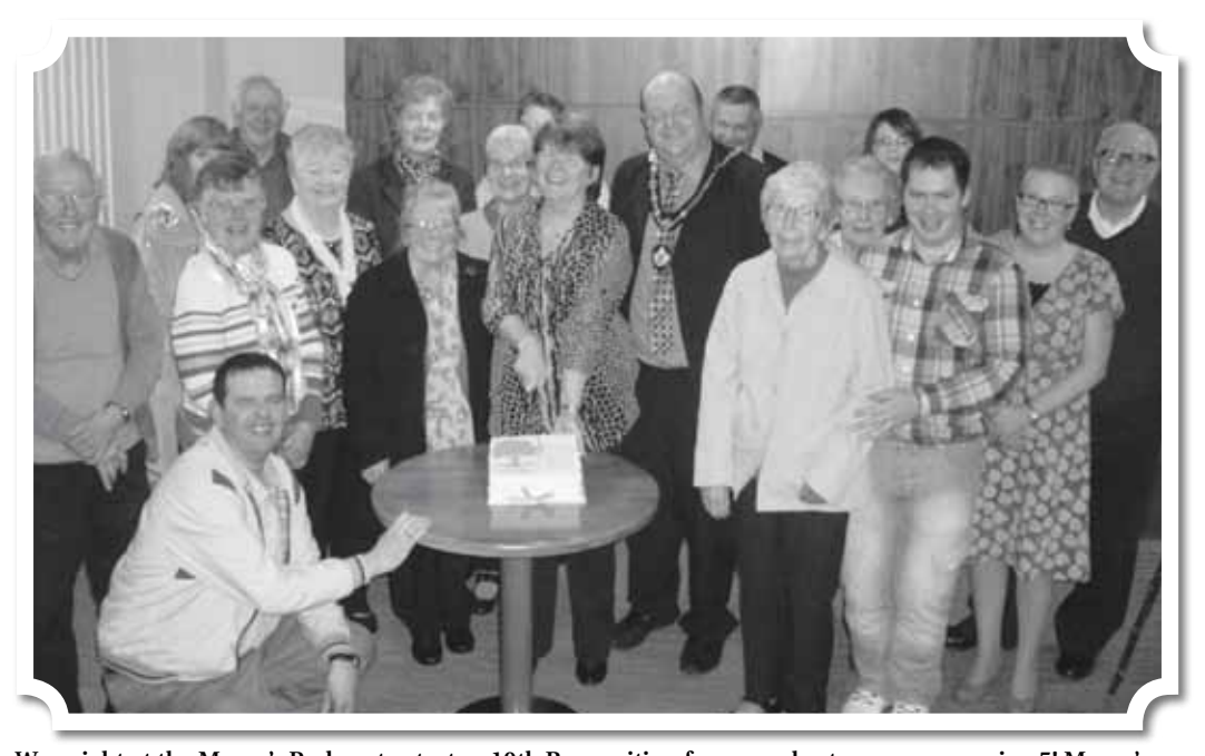
Wee night at the Mayor's Parlour to start or 10th Recognition for our volunteers – an amazing 5! Mayor's Awards for Community Service.